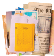
Paper, Newspaper & Magazines